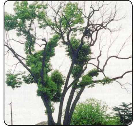
Drought stressed tree.

Sprinklers work best for watering grass, not trees. By using the recommended soaking techniques, you saturate the grass in the spot where the hose is, enabling water to move beneath the root zone of the grass and get to the tree roots where it is needed. Trees can die even when the grass is green, because grass is the better competitor for water.