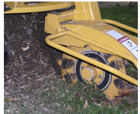
Removing stump safely