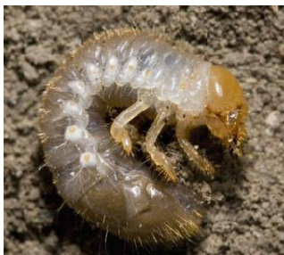
Japanese beetle grub