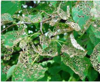
Japanese beetle leaf damage