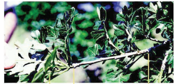
Cambistat® Treated Tree

When caring for urban trees it is important to make a thorough evaluation of the site to accurately diagnose all stressing agents and tailor your care plan to the specific circumstances. These must be dealt with so that your tree can live to its fullest potential. Utilize your arborist for a comprehensive maintenance program.