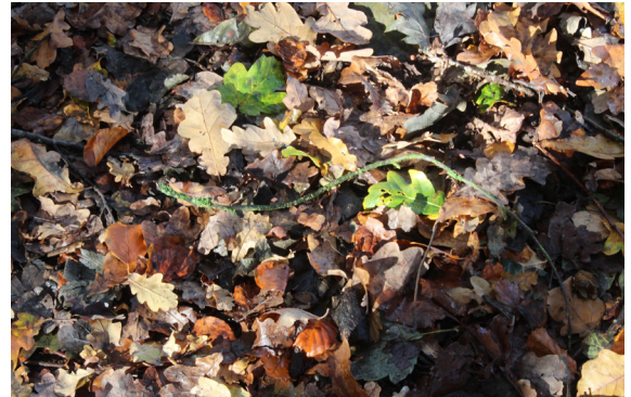
Typical forest floor showing decomposing organic matter.

Trees in the urban environment often need supplemental nutrients to reach their full potential. Trees evolved in forests, where their needs are met perfectly. Trees in the forest are fertilized annually with nutrients provided by the decomposition of fallen leaf litter, twigs, branches, and logs. This process is disrupted in urban settings. The prominence of turf grass is also a major factor affecting tree health in urban settings as the roots of grass plants are aggressive competitors for water, nutrients and rooting space in the soil. These factors contribute to lowered levels of nutrients in the soil and can reduce a tree's ability to collect energy, grow, and defend itself against pest attack.