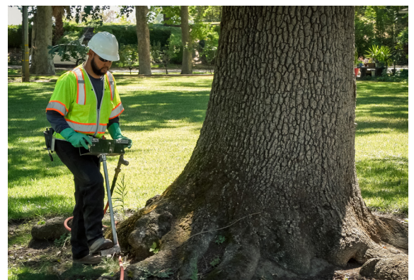
Soil treatment by injecting the nutrients into the ground