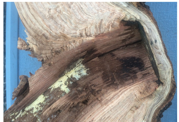
Decay is introduced and spreads into the main body of a tree when the branch collar is removed.