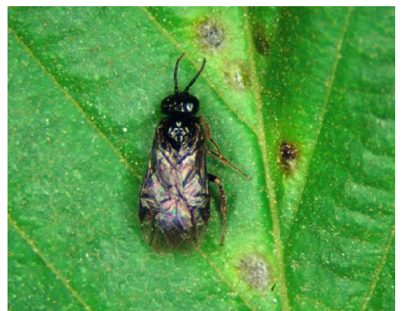
Adult Leafminer on leaf showing damage.