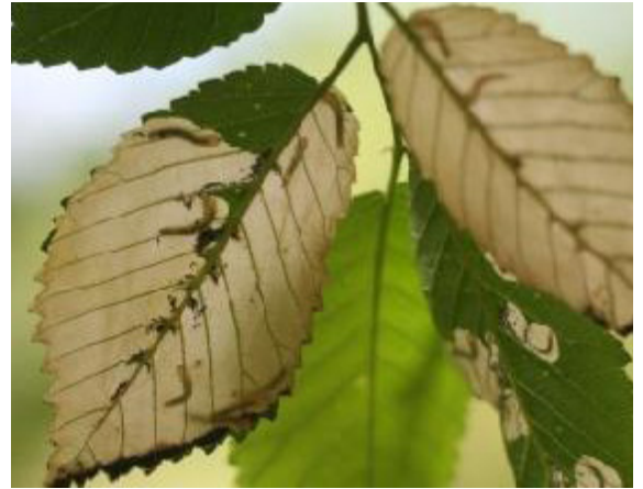
Mined leaves on red elm.